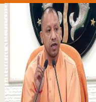
Mahanath Yogi Aditya Nath Ji Maharaj Manager/ Secretary Digvijai Nath Post Graduate College, Gorakhpur, UP