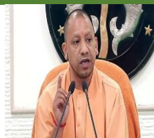
Mahanth Yogi Aditya Nath Ji Maharaj Manager/ Secretary Digvijai Nath Post Graduate College, Gorakhpur, UP